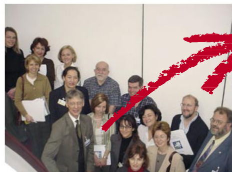
"The ESOP delegates from 14 countries have been present in Hamburg from 22th to 23th January to discuss the important steps for their work in future."

Here is the final program of the IX ISOPP in Turin (IT)