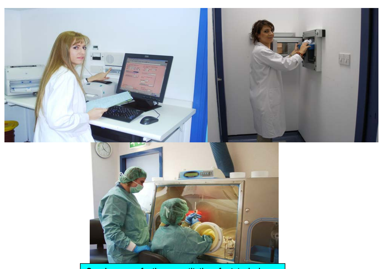
Our clean room for the reconstitution of cytotoxic drugs The reconstitution of cytotoxic drugs is performed by trained nursing personnel